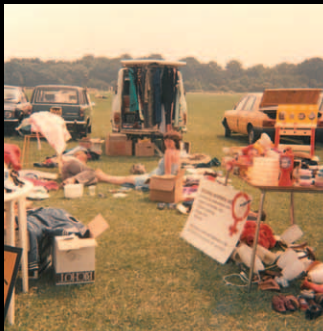
FUNDRAISING AT LIBERALS FAIR BROMLEY COMMON — 1983