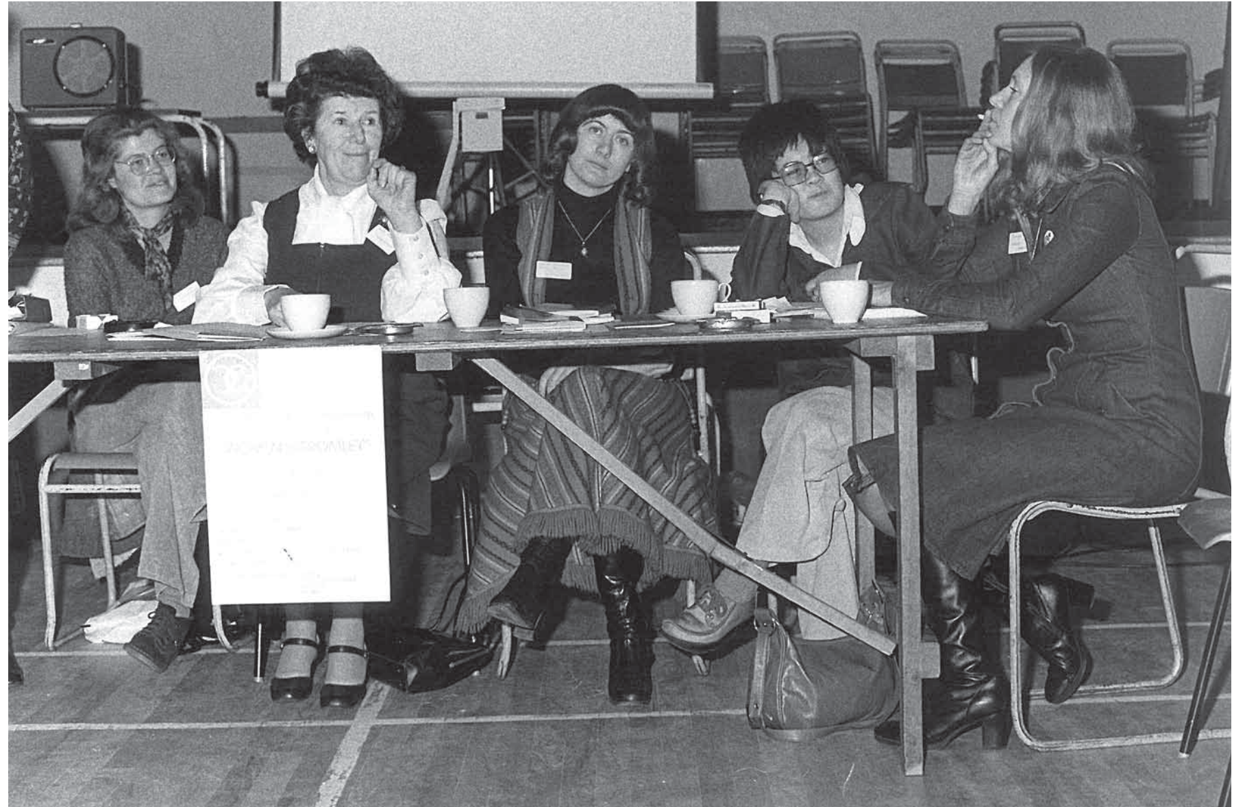
BROMLEY WOMEN'S AID TAKING PART IN A LOCAL CONFERENCE ON WOMEN'S RIGHTS