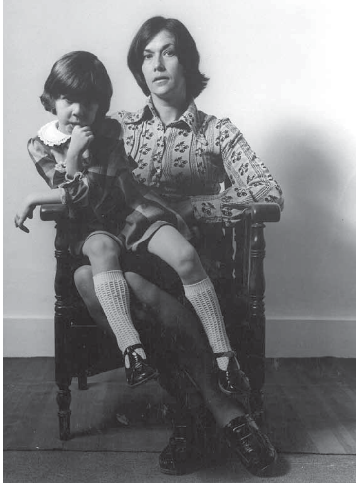
BROMLEY WOMEN'S AID WAS ESTABLISHED AND RUN 100% BY VOLUNTEERS BETWEEN 1975 AND 1983